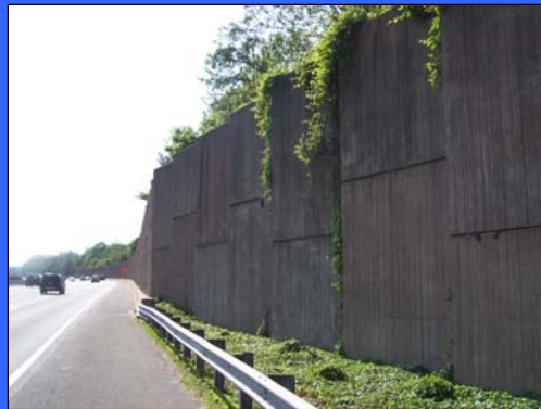
Existing Sound Walls